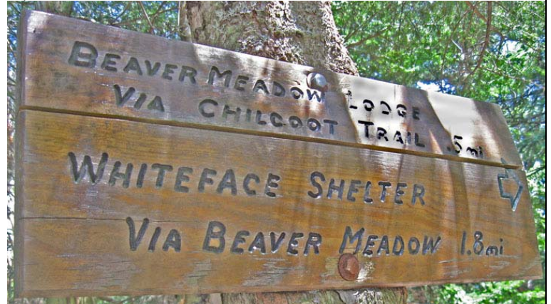
2.) LT: Chilcoat Pass