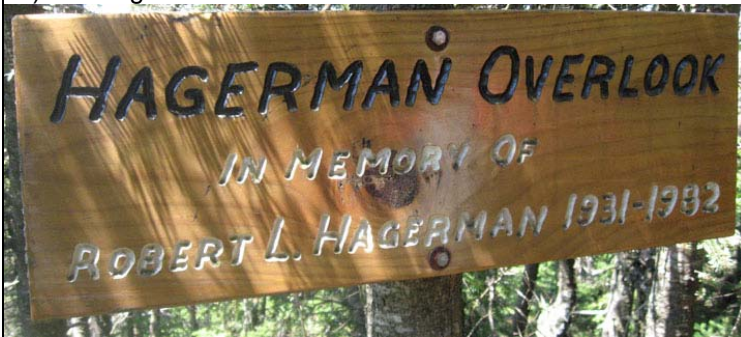
3.) LT: Hagerman Overlook