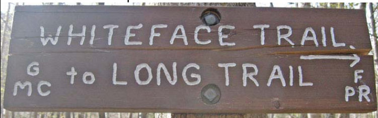
E.) Beaver Meadow Trail: In area of intersection of Beaver Meadow Trail, Chilcoat Trail, Whiteface Trail, and Beaver Meadow Loop.