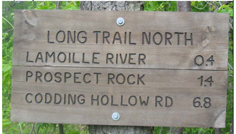
16.) LT: just north of Rte 15