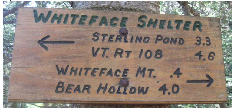
4.) LT: Whiteface Shelter