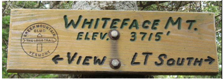
8.) LT: summit of Whiteface