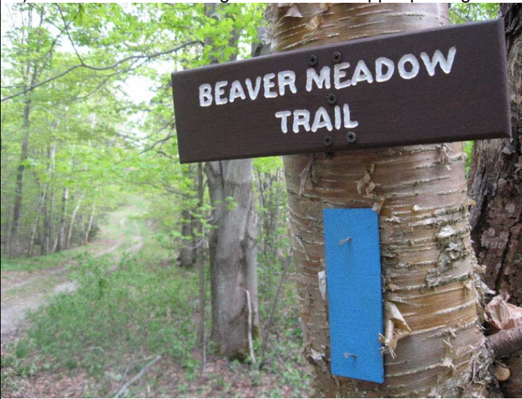
A.) Beaver Meadow Trail: gate/trailhead at upper parking lot.