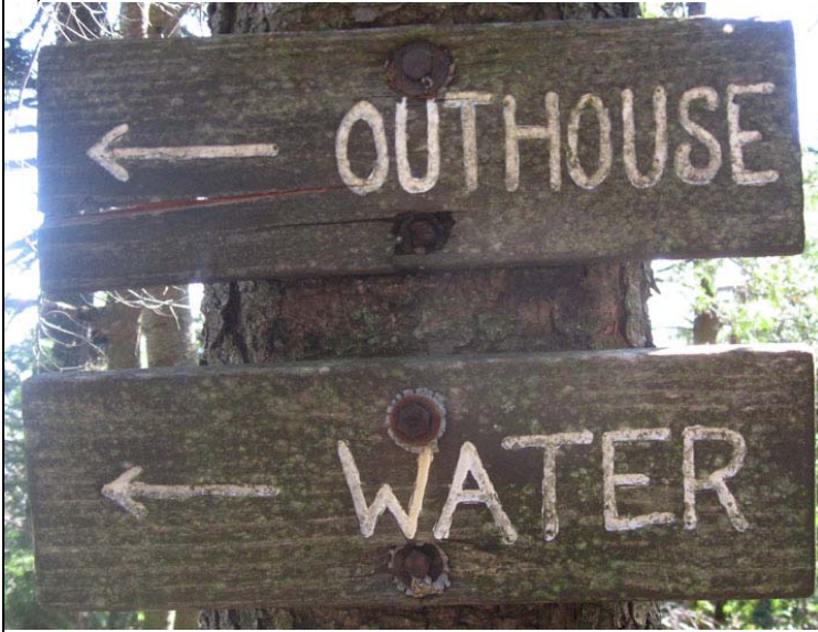
5.) LT: Whiteface Shelter