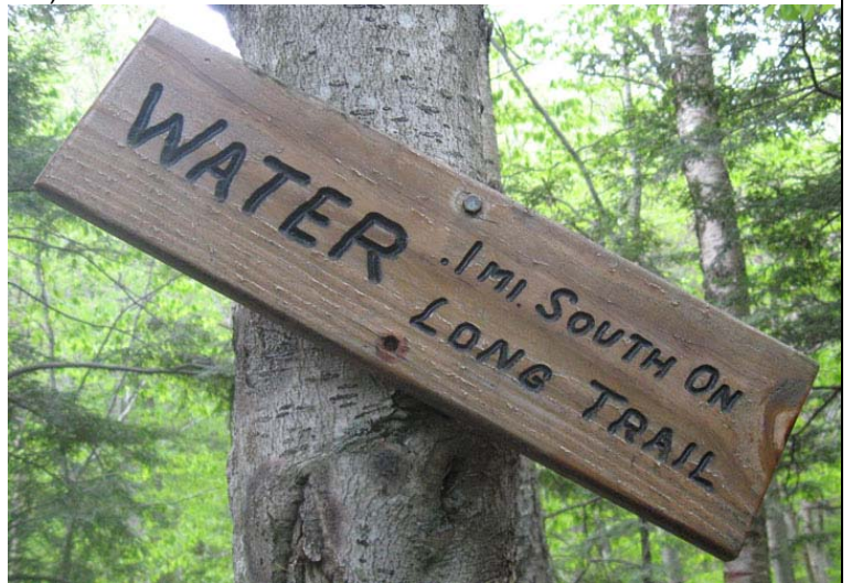
14.) LT: Bear Hollow Shelter