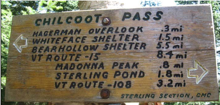
1.) LT: Chilcoat Pass.