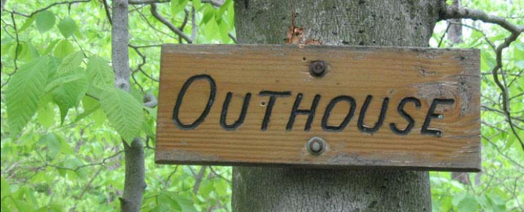
13.) LT: Bear Hollow Shelter