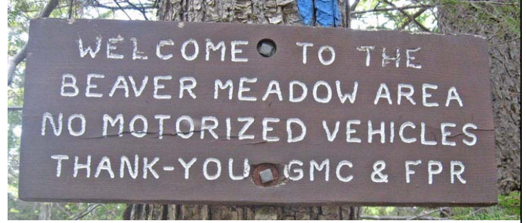
B.) Beaver Meadow Trail: just uphill from intersection with VAST trail.