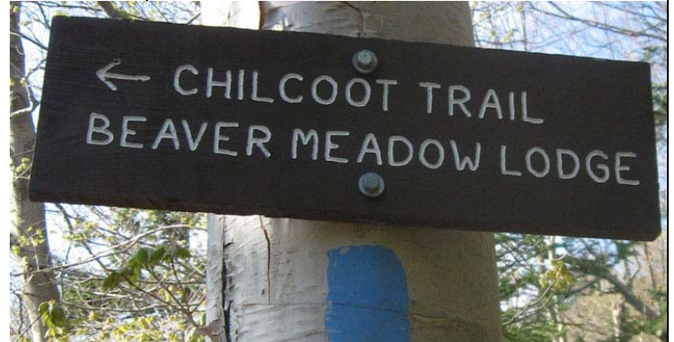
D.) Beaver Meadow Trail: In area of intersection of Beaver Meadow Trail, Chilcoat Trail, Whiteface Trail, and Beaver Meadow Loop.