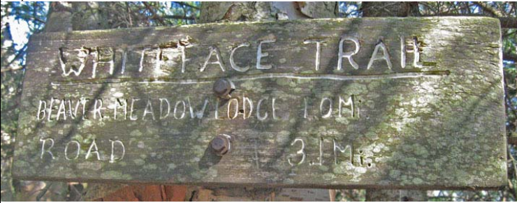
7.) LT: Whiteface Shelter