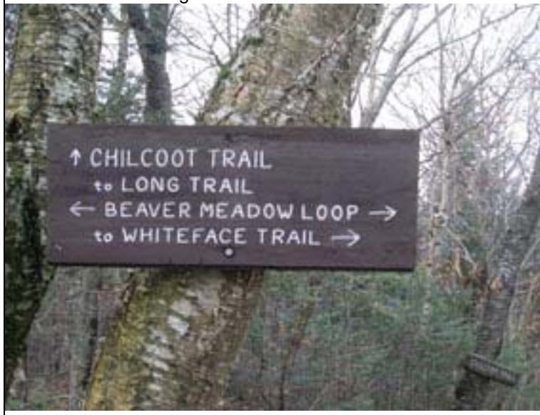
G.) Beaver Meadow Loop: At junction with Chilcoot Trail, next to Beaver Meadow Lodge.