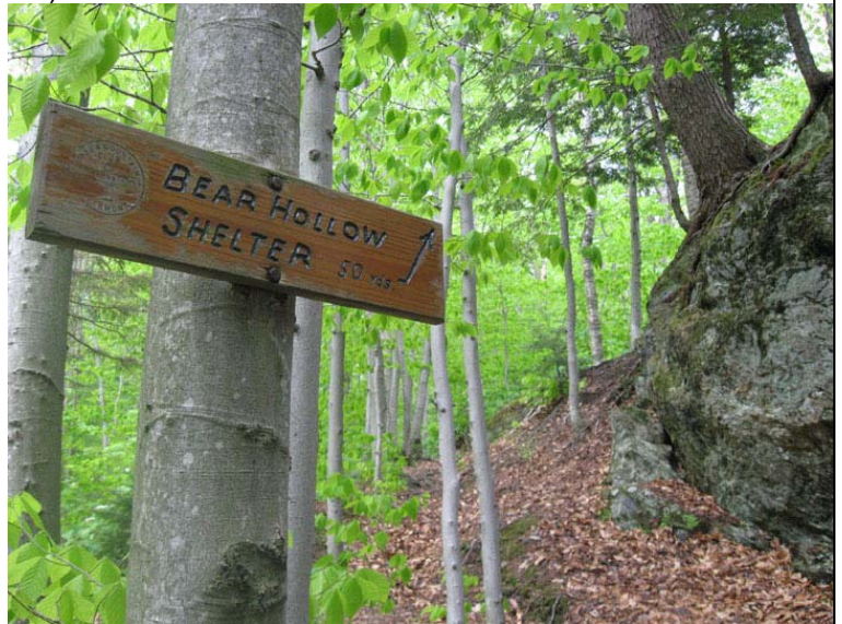
10.) LT: Bear Hollow Shelter