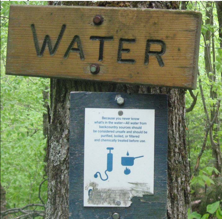
9.) LT: just south of Bear Hollow Shelter