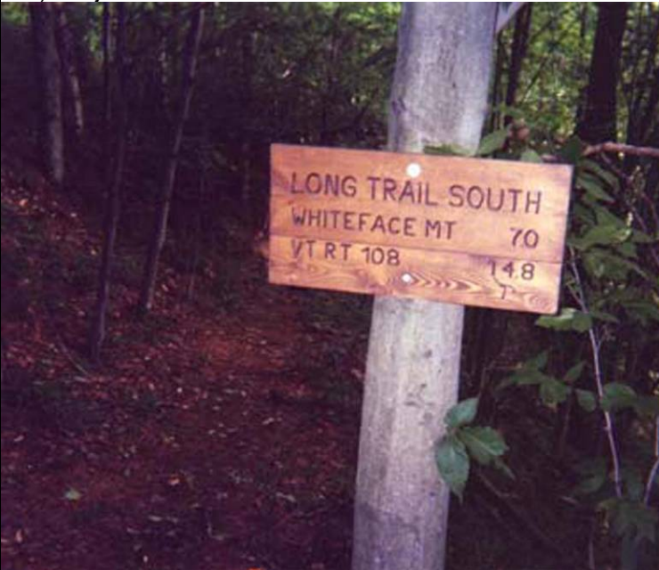
15.) LT: just south of Rte 15